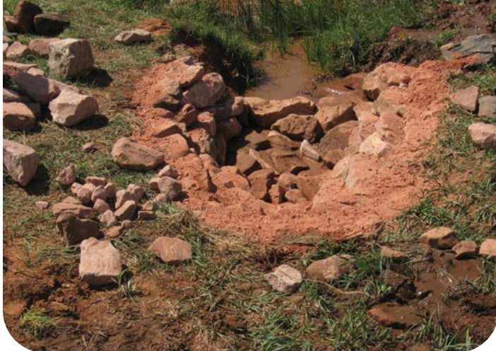
A volunteer-built “Zuni Bowl” rock feature prevents stream “head cutting” (a type of erosion). The bowl structure is so named because it has been used by the Zuni Pueblo people since ancient times; 2018 photo.

Last year, for the first time in living memory, Campbell Creek supported fish.