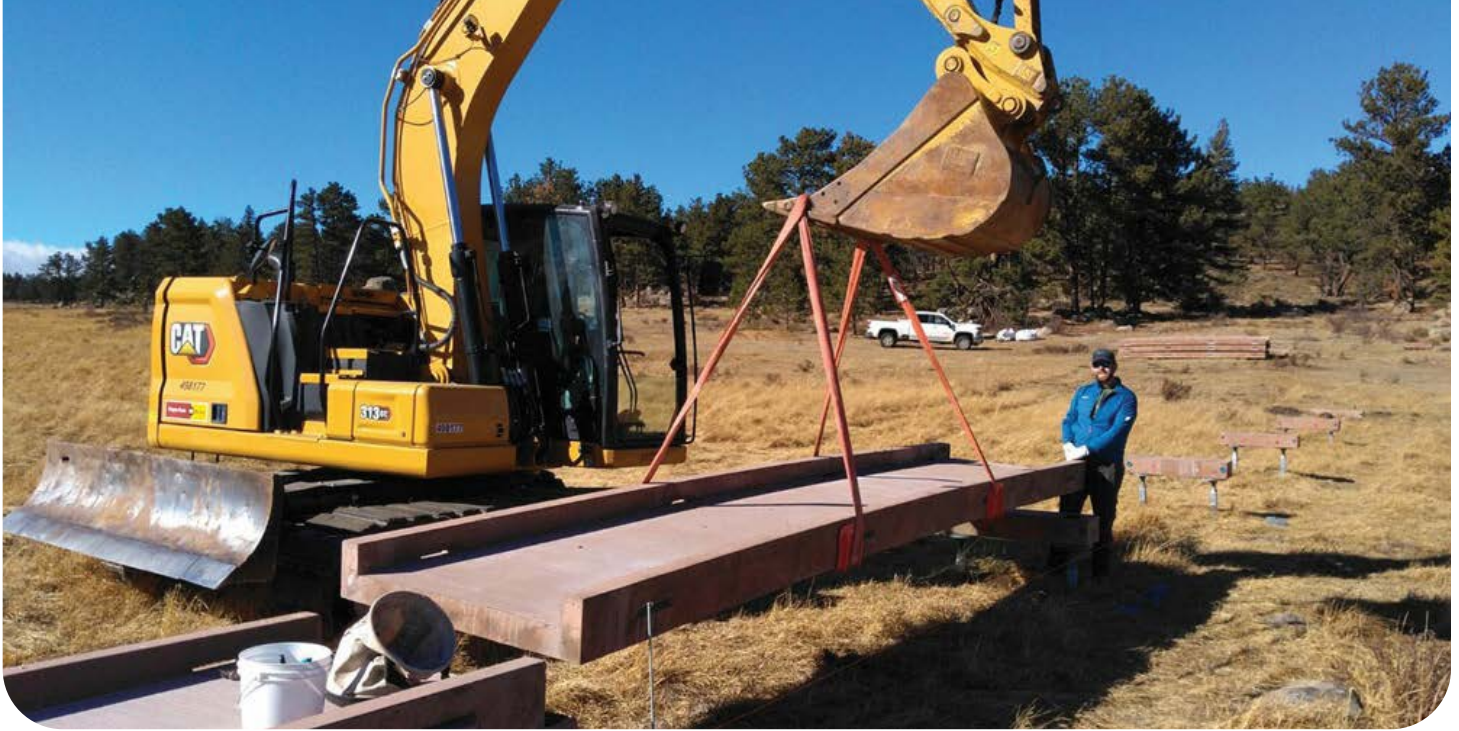
Kaleigh uses an excavator to lift and place concrete boardwalks with assistance from Dale. All 34 20-ft sections took two weeks to set, adding up to 680 ft of concrete boardwalk.