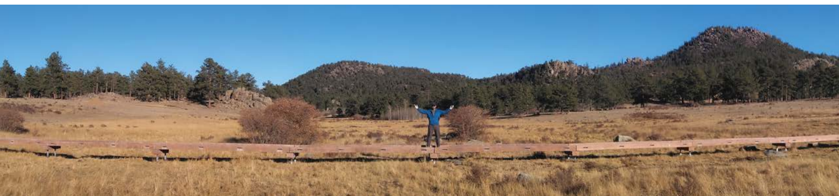
Dale stands on a completed stretch of the concrete walkway.

Your generosity isn't just building a trail — it's building belonging for people with mobility challenges.