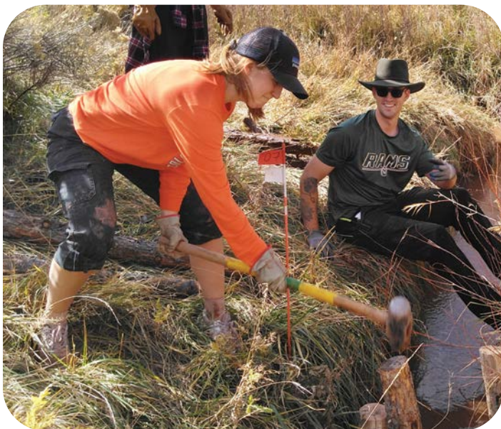
Volunteers hammer posts into a Campbell Valley waterway to build a “beaver dam analog,” a structure that will capture sediment, slow the flow, and reconnect the creek to the floodplain. The posts were cut by WRV sawyer volunteers thinning stands of forest to reduce fire risk.

Beginning in 2010, WRV volunteers reintroduced meanders into streams and gullies. They used cutting-edge techniques developed by Bill Zeedyk to “let the water do the work.” [See back cover to read about a WRV event honoring Zeedyk.] Then, volunteers replanted streamside plants and built new wetlands out of sedimented reservoirs.