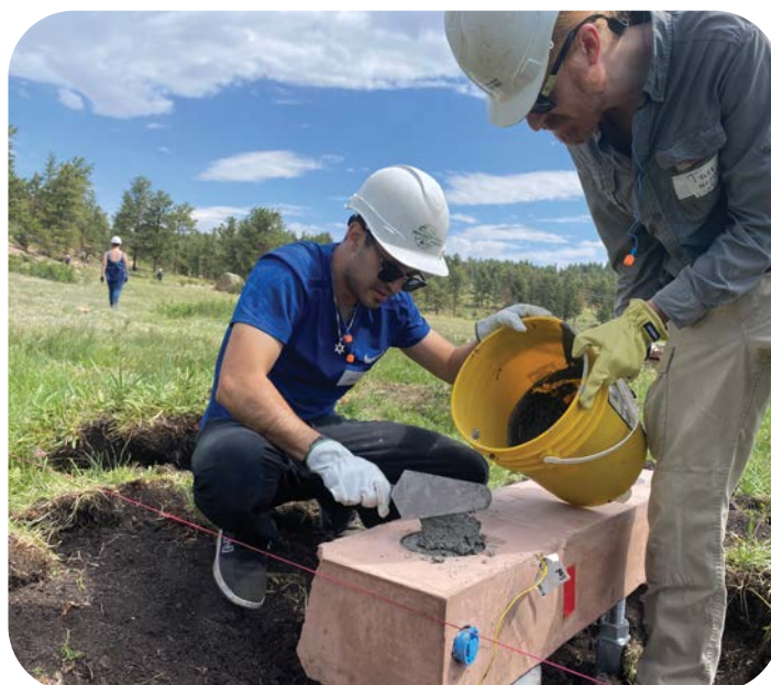
Volunteers mixed and poured about 1,300 pounds of grout into 40 sills (horizontal beams that support the boardwalk).